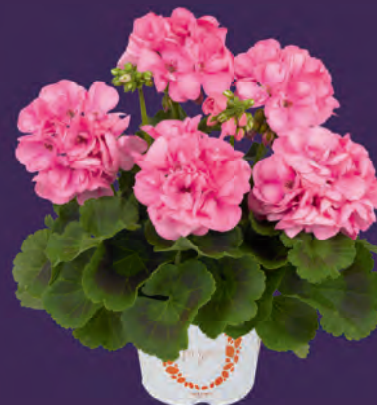
BIG EEZE PINK