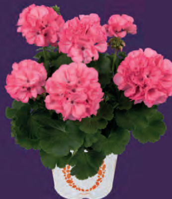
BIG EEZE FOXY FLAMINGO