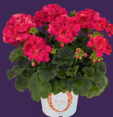
BIG EEZE NEON