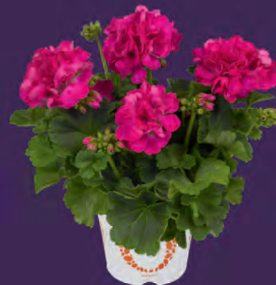
BIG EEZE FUCHSIA BLUE