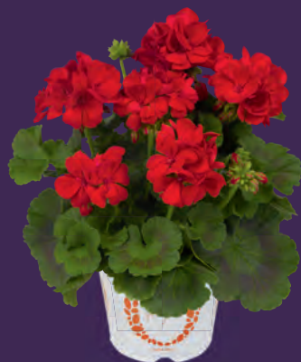
BIG EEZE DARK RED